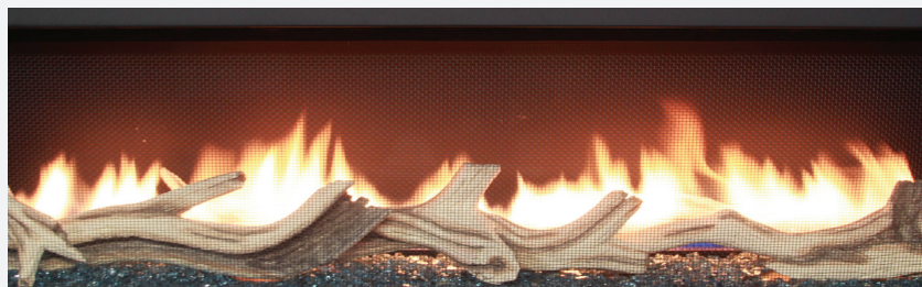
Realistic hand-detailed driftwood set

NOTE: SANTA MONICA standing pilot version operates without any electrical supply. Blower and Electronic Ignition System require electricity for operation.